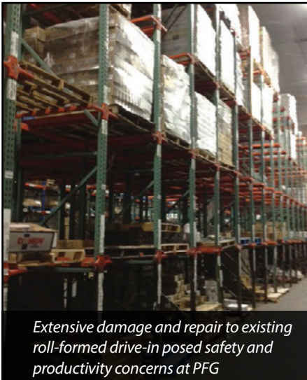
Extensive damage and repair to existing roll-formed drive-in posed safety and productivity concerns at PFG

PFG turned to long term systems partner, E-Distribution, for help. E-Distribution had completed over 30 successful storage system projects for PFG including new and used rack system design, installation, teardown and remodel projects.